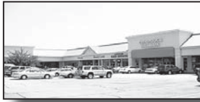
Ballou Park Shopping Center Danville, VA 600 to 21,631 SF Lease - $10 PSF NNN Allyson Petty, Jason Bernstein