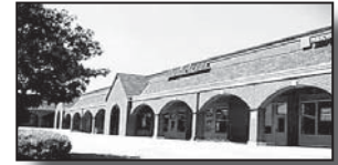
Kingsgate Greene Williamsburg, VA 118-122 Waller Mill Road 1,640 to 5,160 SF Lease - $12.00 PSF NNN Allyson Petty, Jason Bernstein