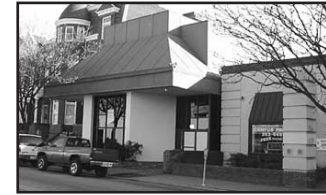
NEW VCU Area 911-1/2 W. Grace Street 2,200 SF Lease - $13 - $14 NNN Brian Glass