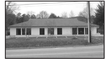
NEW 316 N. Arch Road 3,200 SF Lease - $14.00 NNN Susan Jones