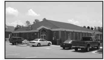
Julian's Barony Restaurant 11129 Three Chopt Road 6,715 SF Sale - Asking $2,000,000 Established restaurant with equipment. Brian Glass