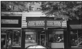
SOLD 105 E. Broad Street 8,580 SF Sale - $395,000 Brian Glass