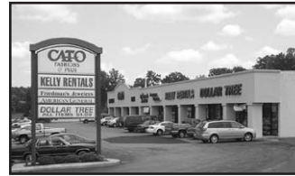
Park Hill Plaza South Hill, VA 3,200 SF Lease - $14.00 NNN Allyson Petty