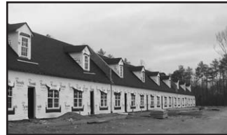
Bell Creek Flex Condos New Construction 2,500 to 25,000 SF Sale - $95 PSF Lease - $9.50 PSF NNN David Williams, Stuart Cary