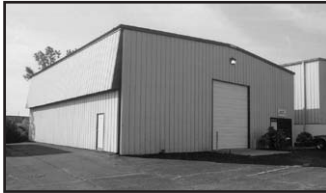
Leased Hanover Air Park 11064 Air Park Drive 3,000 SF Lease - $7.20 MGRS Stuart Cary