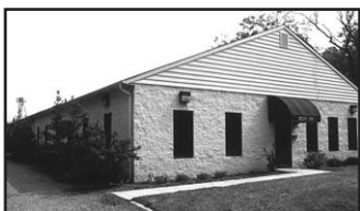
Ashland 14433 Washington Hwy 5,500 SF Lease - $9.00 NNN Stuart Cary OPEN LISTING