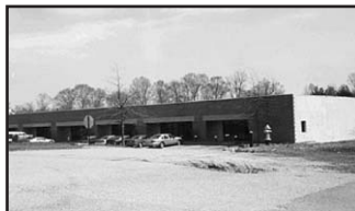
Lakeridge Trade Center 10470 Wilden Drive 2,400 Sf Lease - $5.50 NNN Jason Hetherington, Stuart Cary OPEN LISTING