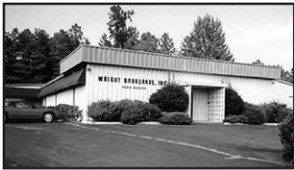
Ellerson Industrial Park 8436 Erle Road 8,600 SF Sale - $450,000 Lease - $5.75 NNN Lee Hilbert, Jason Hetherington