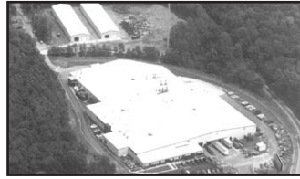
Price Reduced! Waverly Textiles 8401 Fort Darling Road 136,017 SF Sale $3,157,925 - Lease $3.25 Bill Mattox, Jason Hetherington