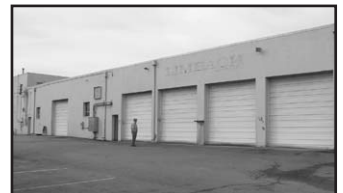
NEW Mechanicsville 2415 Anniston Street 9,186 SF Lease - $5.50 NN Jason Hetherington