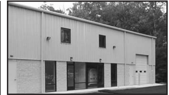
Ashland 10430 Dow Gil Road 2,600SF Lease - $6.75 MGRS Bill Mattox