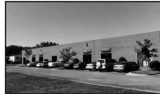
Air Park Office Suites 11139-59 Air Park Road 2,125 - 4,250 SF Lease - $8.00 MGRS Stuart Cary