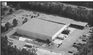
309 Quarles Road 20,000 - 78,408 SF Lease - $4.50 NNN Additional acreage for expansion or build-to-suit. Sale - $3,650,000 David Williams, Stuart Cary