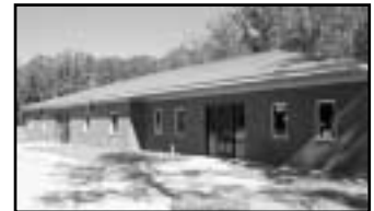
9410 Atlee Commerce Blvd 2,000 SF Office Space $12.00 PSF Stuart Cary