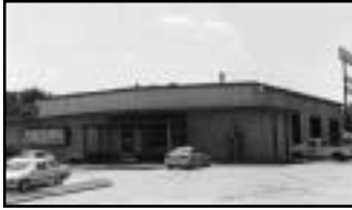
Tomahawk Truck 9300 Burge Avenue 7,572 SF on 3 Acres Lease - $6,500 per month Dawn Carson, Stuart Cary