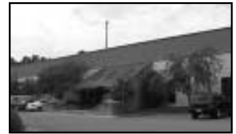
Telecommunications Center 10463 Wilden Drive 64,064 SF Sale - $2,900,000 Dawn Carson, Stuart Cary, Steve Gentl