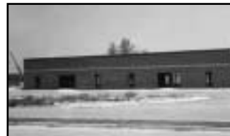
2725 Oak Lake Blvd 2,880 - 12,000 SF Lease - $5.50 - $10.50 Jason Hetherington, Andrew Ferguson