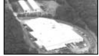
Waverly Textiles 8401 Fort Darling Road 136,017 SF Sale - $3,157,925 Bill Mattox, Dawn Carson, Jason Hetherington