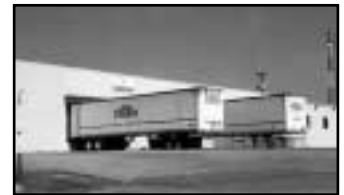
Former Show Best 2400 Magnolia Road 25,000 SF Lease - $4.10 NNN Jason Hetherington, Dawn Carson