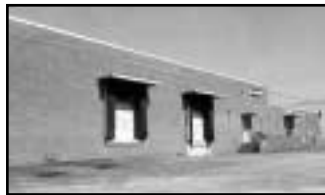
Flex/Warehouse/Production 2300 Magnolia Road 36,361 SF Lease - $3.75 Gross David Williams