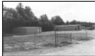
100 Ashcake Road 1,560 - 2,880 SF on 3.61 Ac Sale - $500,00 Lease - $50,000/year Stuart Cary