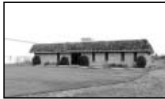
Hanover Industrial Park 10986 Leadbetter Road 3,000 SF Lease - $10 MGRS Stuart Cary