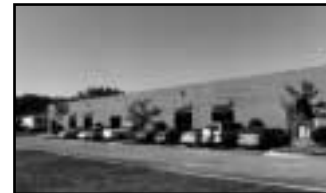
Air Park Office Suites 11139-59 Air Park Road 2,125 - 8,500 SF Lease - $10 MGRS Stuart Cary