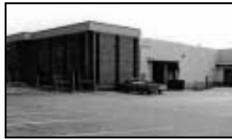
Dabney Area 4825 Bethlehem Road Sale: 105,723 SF - $2,500,000 Lease: 76,170 SF - $3.25 MGRS Dawn Carson, Stuart Cary, Jason Hetherington